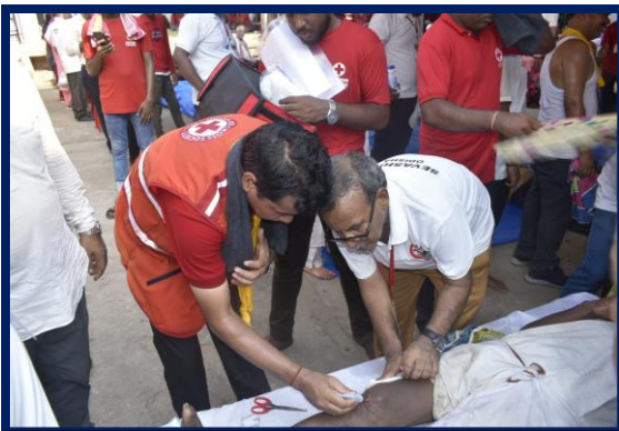
First-Aid service provided