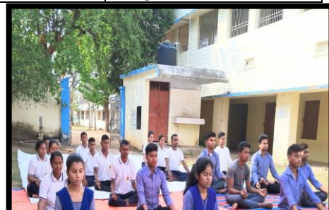
BoudhPanchayat College, Boudh