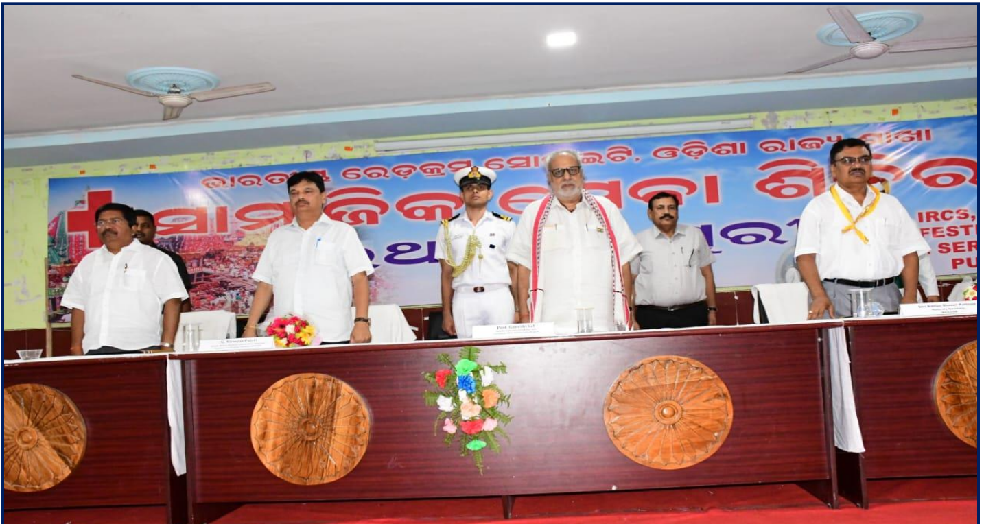
Inaugural function of Social Service Camp on the occasion of Car Festival -2023