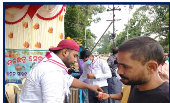
JRC Nabarangpur at DEO Office