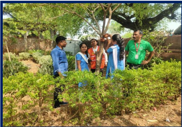
Eco Club and Junior Red Cross Unit of Deng High School in Saituntala Block of Balangir district organized a water supply program for animals in Anukully