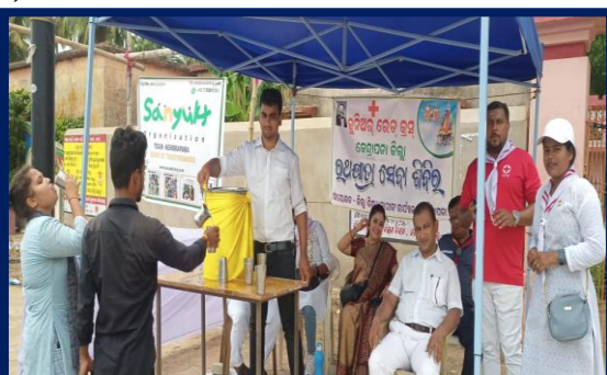
JRC Kendrapara at Baldevjew Temple

On the eve of car festival, JRC Counsellors from different districts joined with State branch for rendering different service to near about 20 lakh devotees during car festival at Puri, Mayurbhanj, Kendrapara. Volunteers also join in the social service camp and rendered different services like water sprinkling, water distribution, mask distribution, first aid service, cleanliness service etc.