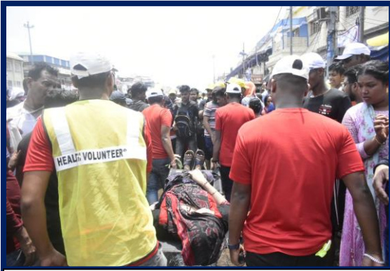
Stretcher service provided