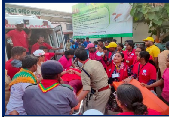
Ambulance Service Provided