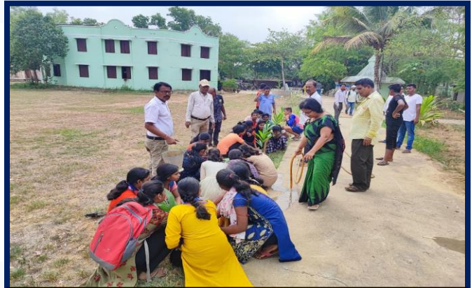
Observation of World Environmental Day at Marichipur Govt H S Baramundali.