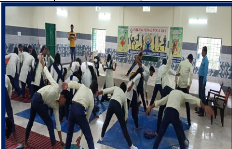
Nabarangpur College, Nabarangpur