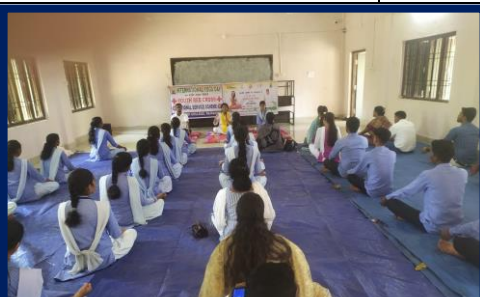
BhimBhoi College, Sambalpur