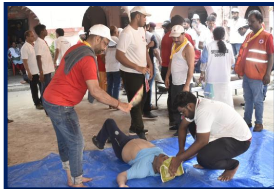
First-Aid service provided