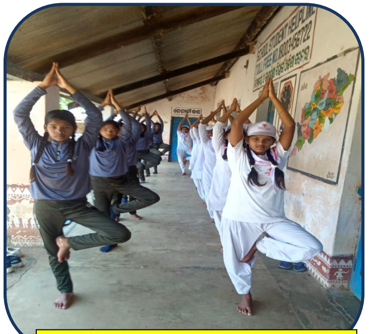
Observance of World Health Day at JRC JKoraput