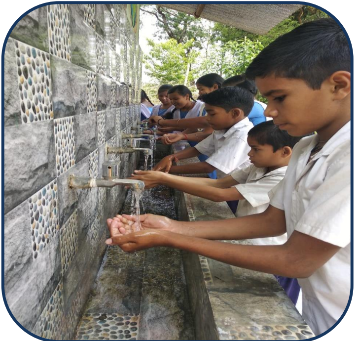
Clean and good health programme Bargarh