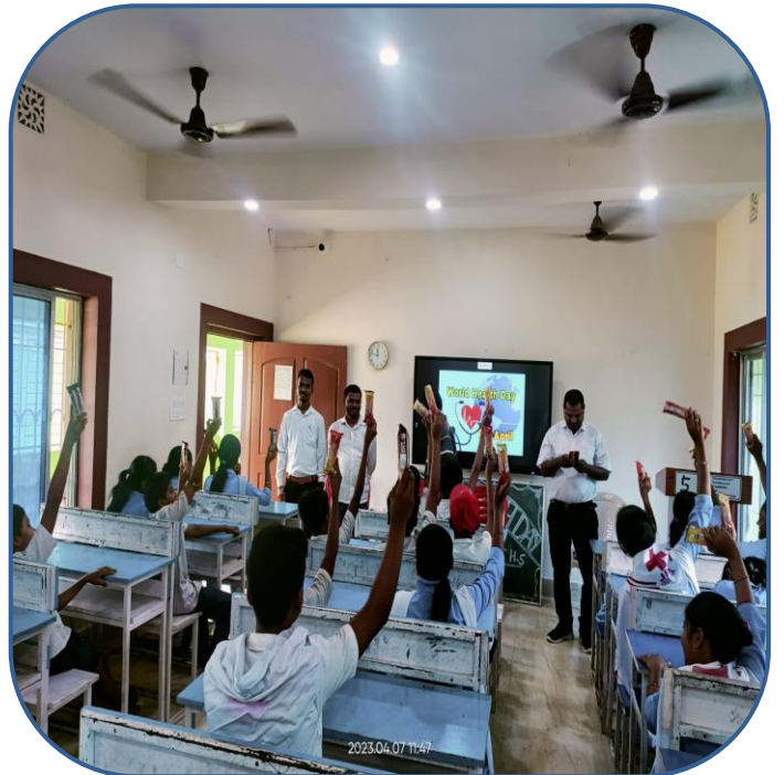
Observance of World Health Day at JRC Balasore