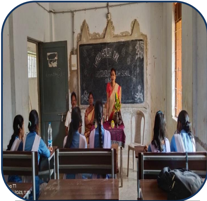
Observance of World Health Day at JRC Gurudijhatia Girls High School