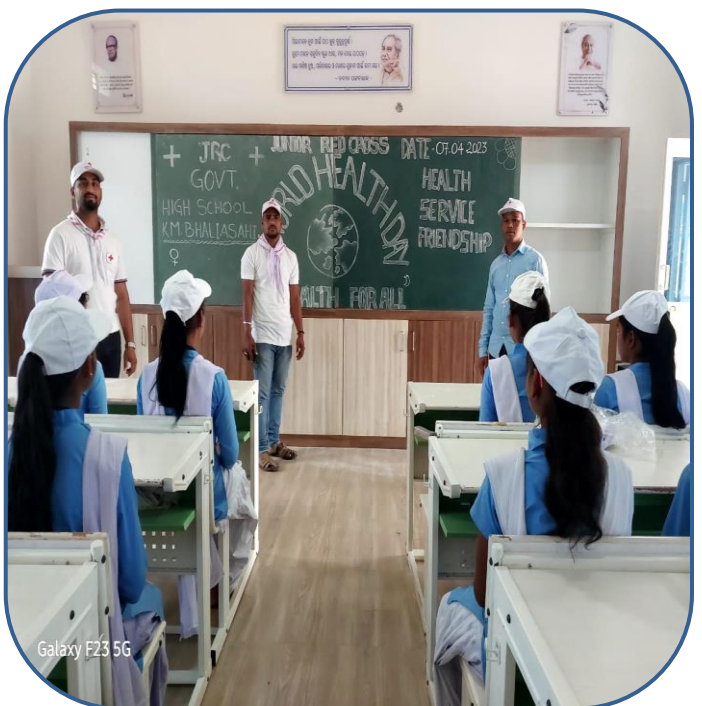
Observance of World Health Day at JRC Sonepur