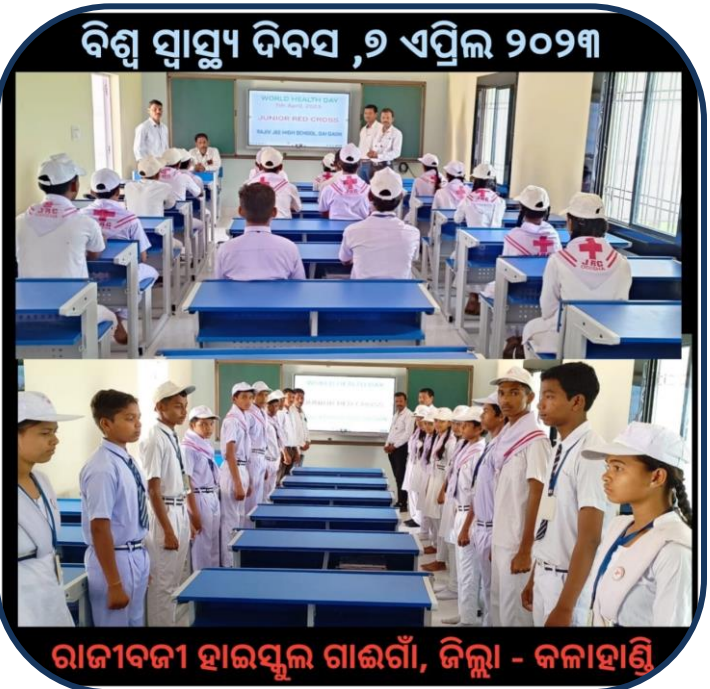
ରାଜୀବଜୀ ହାଇସ୍କୁଲ ଗାଈଗାଁ, ଜିଲ୍ଲା - କଳାହାଣ୍ଡି Observance of World Health Day at Kalahandi