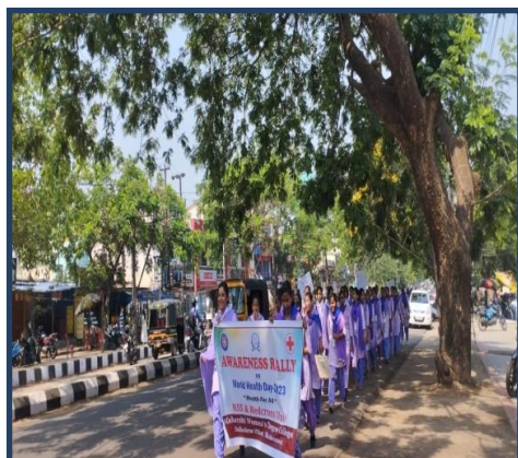
Maharshi Women's Degree College, Bhubaneswar