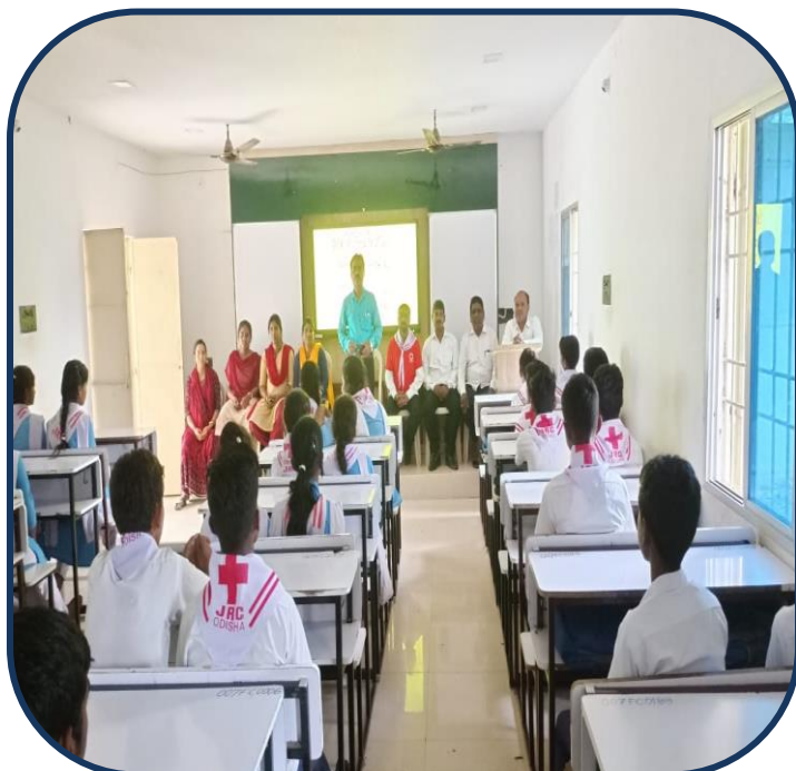
Observance of World Health Day at JRC Nabarangpur