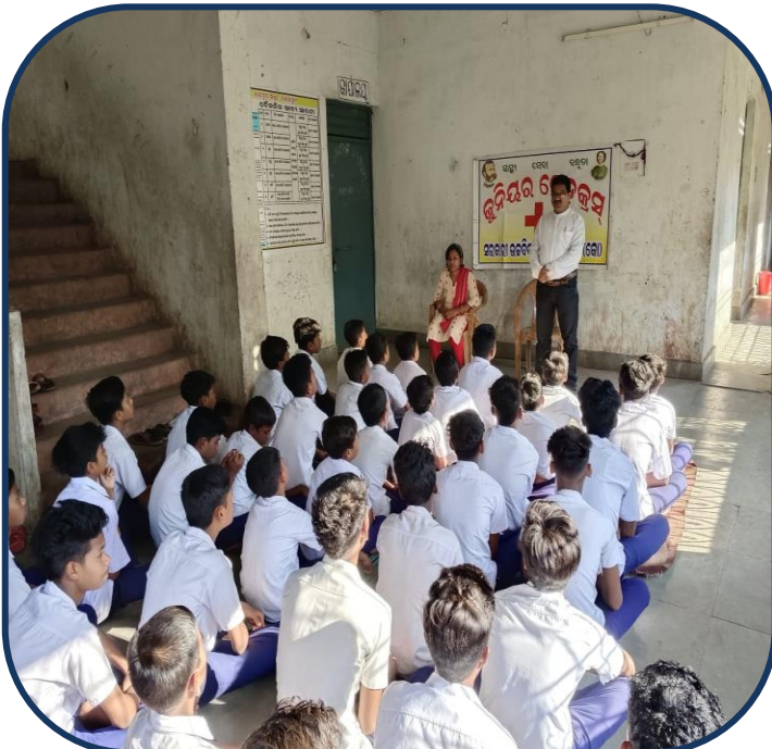
Observance of World Health Day at JRC Jeypore