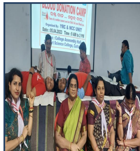
Stewart Science College,