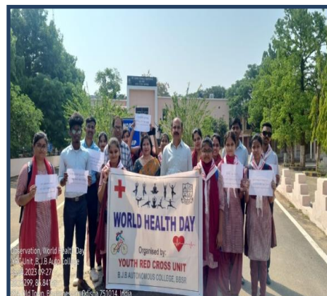
BJB (A) College, Bhubaneswar