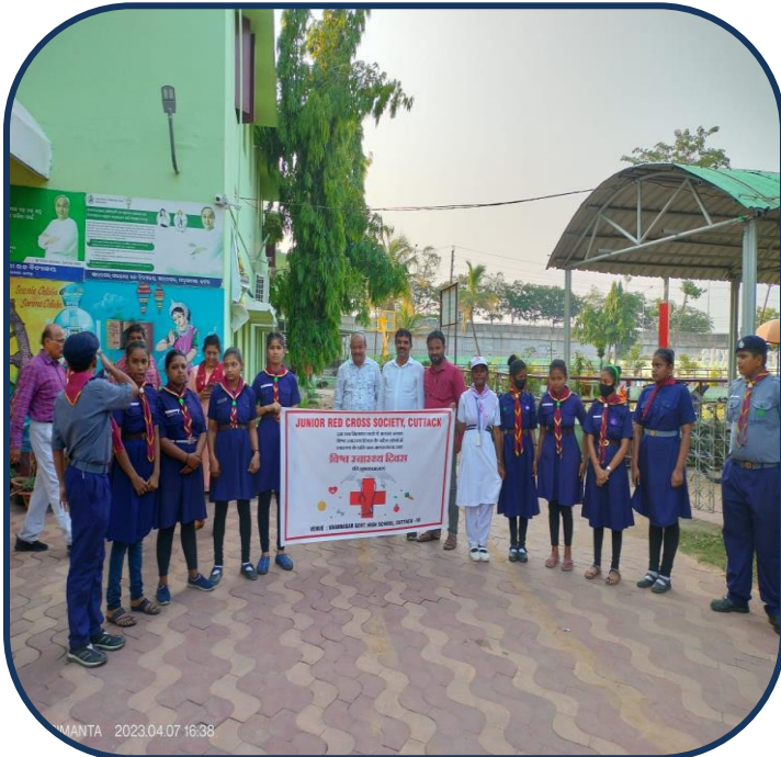
District level Awareness Rally on World Health Day – 2023