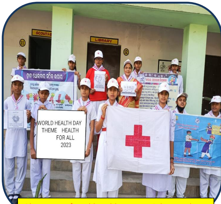
Observance of World Health Day at JRC Jharsuguda