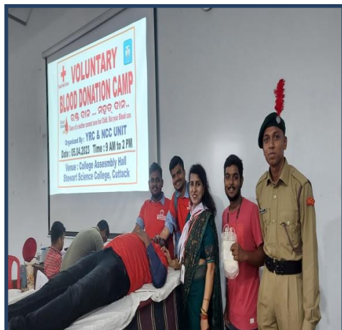
Stewart Science College, Cuttack