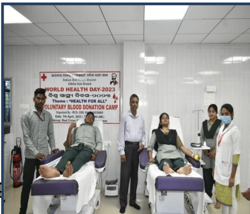
KunjaBihari (Degree) College, Baranga, Khordha