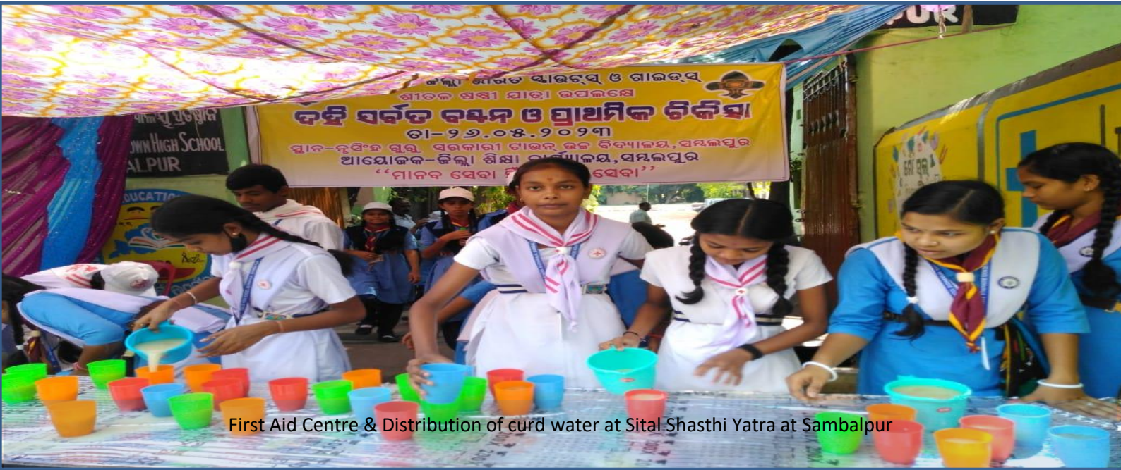
First Aid Centre & Distribution of curd water at Sital Shasthi Yatra at Sambalpur