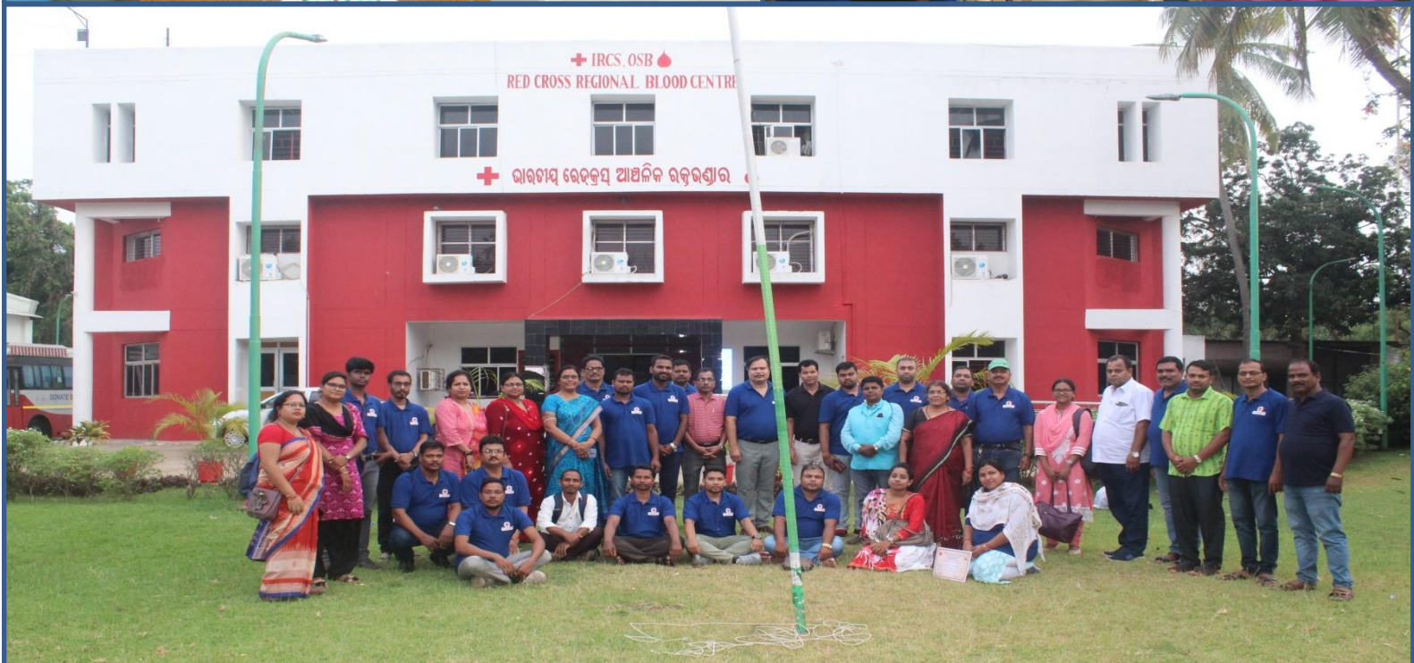
YRC UNTRAINED COUNSELLOR TRAINING FROM 24-26 MAY 2023 AT RED CROSS BHAWAN