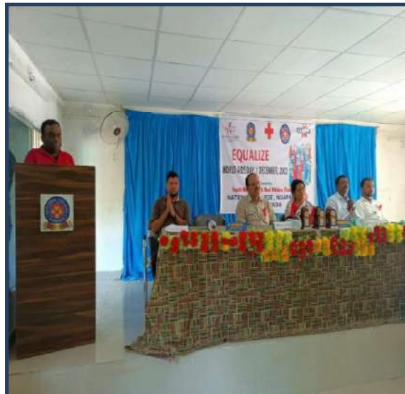
World AIDS Day at College level on 01.12.2023