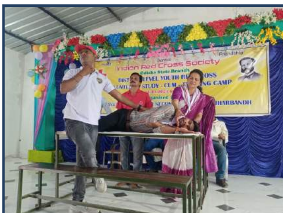
P.S. Higher Secondary School, Jharbond, Bargarh