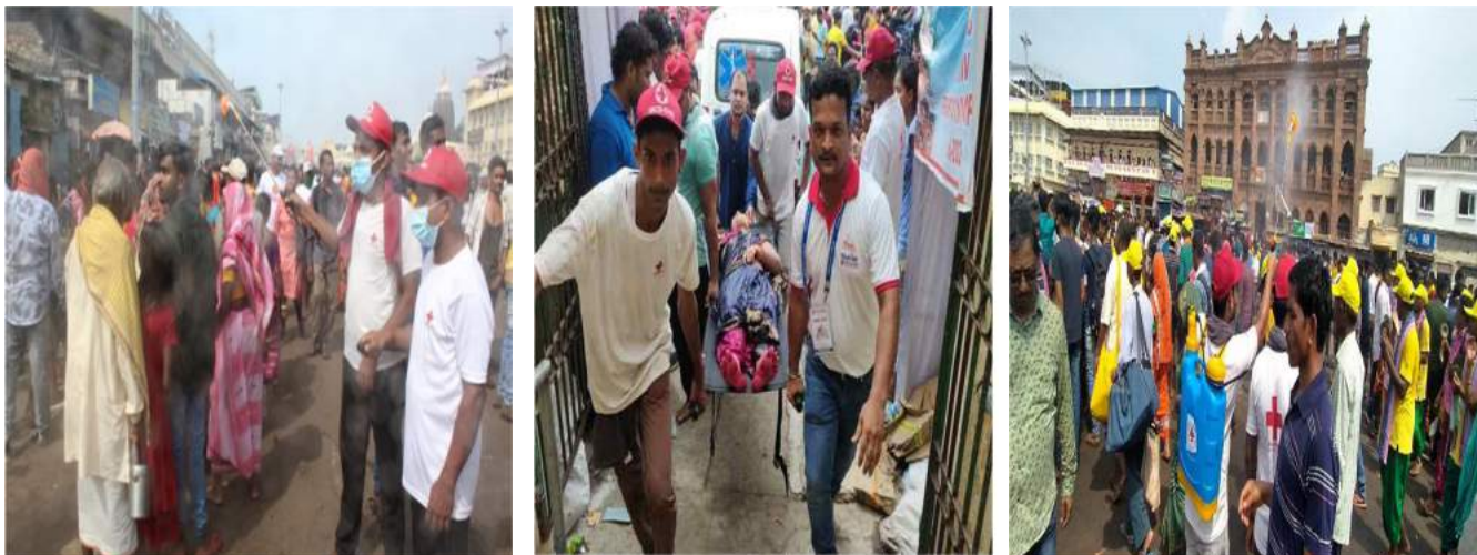
Social Service Camp during RathaYatra at Puri