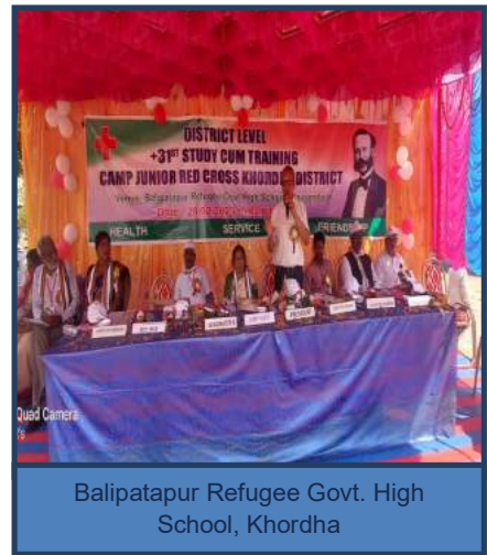
Balipatapur Refugee Govt. High School, Khordha