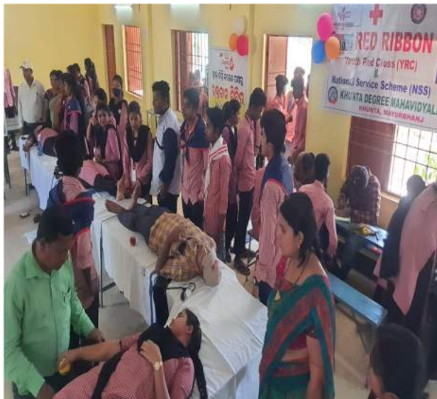
Khunta Degree College, Mayurbhanj