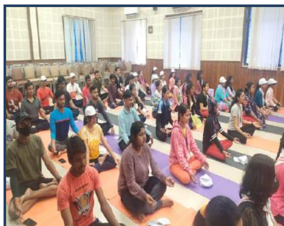
Srusti Academy of Management(Autonomous)