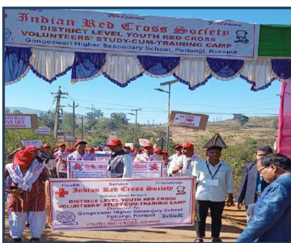
Gangeswari Higher Secondary School,,Koraput