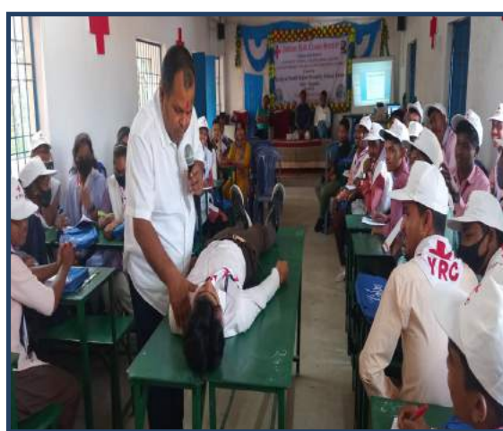
P.S. Higher Secondary School, Komna,Nuapada