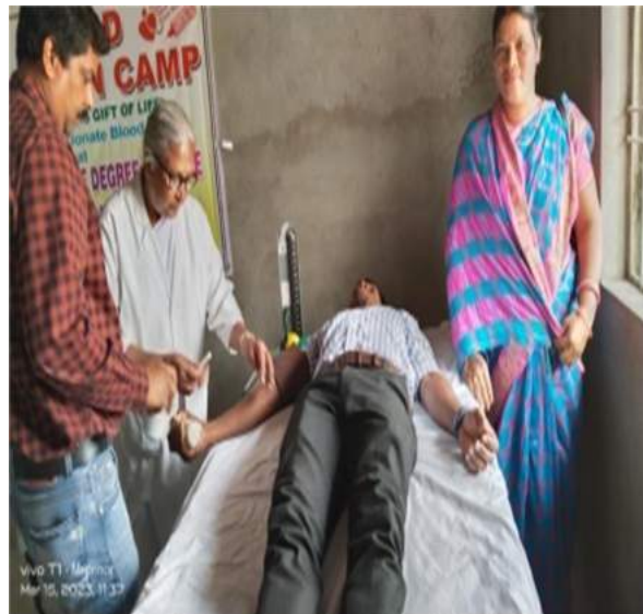
Palasama science Degree College ,Deogarh