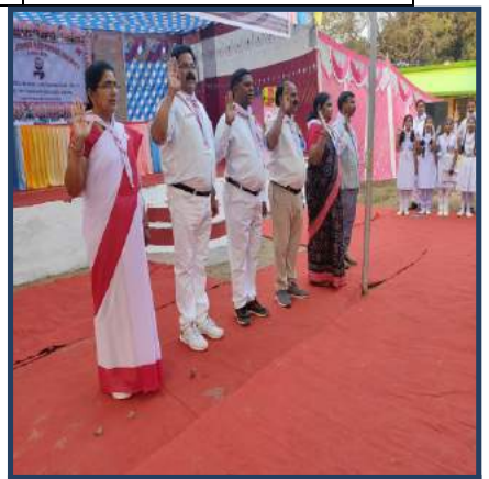
Govt. Panchayat High School, Chipilima, sambalpur