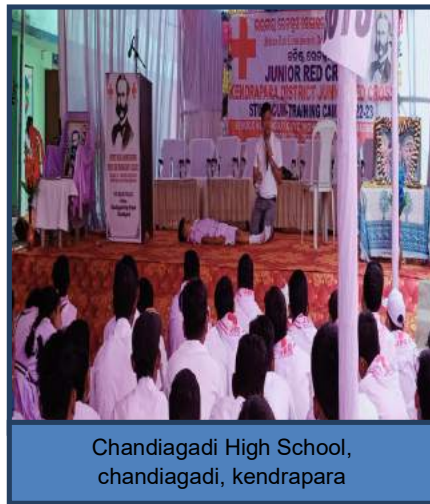
Chandiagadi High School, chandiagadi, kendrapara