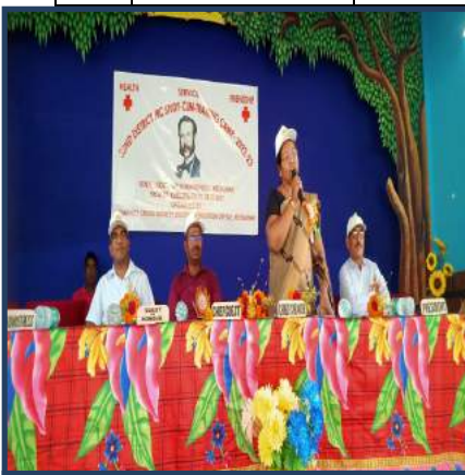
Govt. Girls High School, Keonjhar