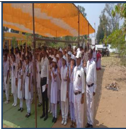
P.S. Higher Secondary School, Jharbond, Barqarh