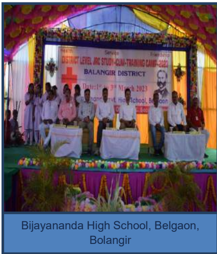
Bijayananda High School, Belgaon, Bolangir