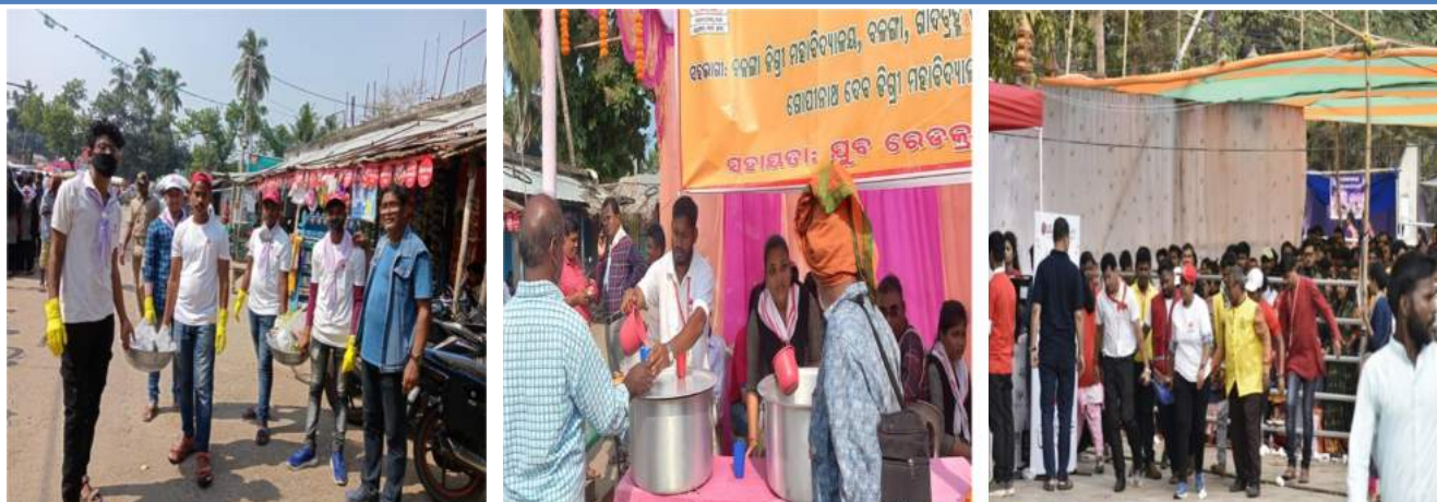
Social Service Camp during Anal Nabamiat SakhigopalPuri and Shiva Ratri at Lingaraj temple, BBSR