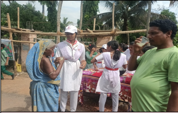
Bajramohakali Nodal High School, Kendrapda

Distribution of Dahi Sarbat, Lemon Water and drinking water to the public in different district.