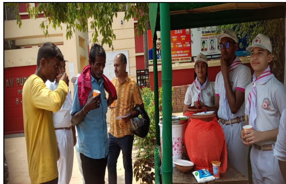
DAV Public School Pokhariput, Khordha