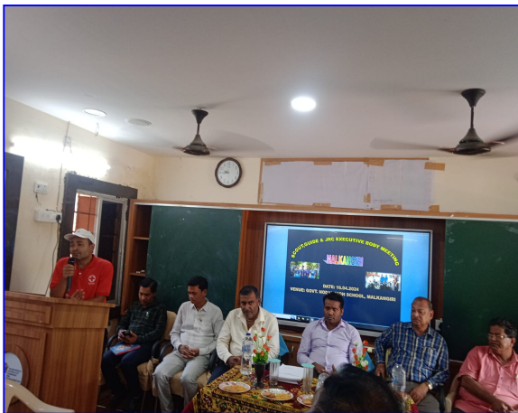
Govt.Nodal High School, Malkangiri