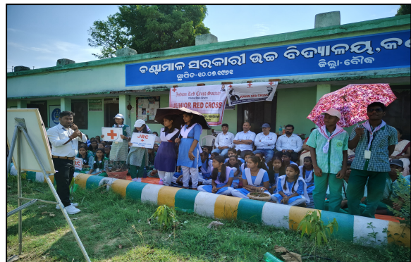
Kantamala Govt. High School, Boudha