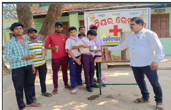
Govt. High School, Koraput