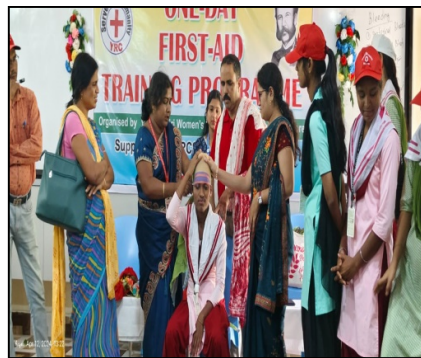
Nilagiri Women's Degree College, Balasore