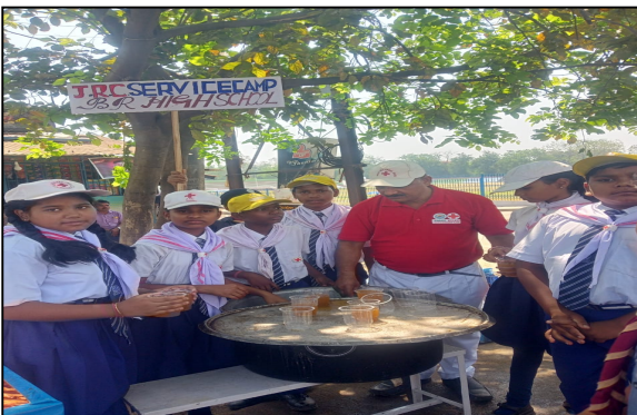
B.R.HIGH SCHOOL, BELPAHAR, Jharsuguda