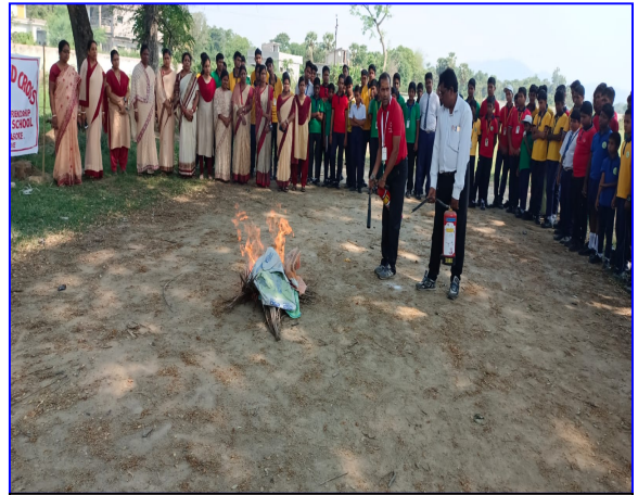
Govt. High School Khaira, Balasore