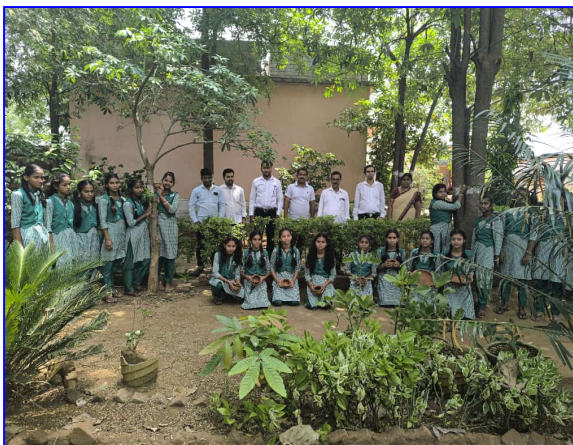
Govt. High School, Denga, Balangir