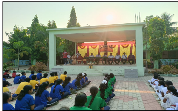
Janasakti GHS Chahali Nayagarh