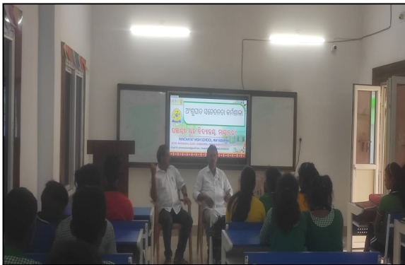
Panchayat High School, Mayabarha, Sonepur