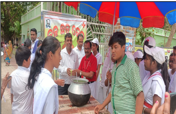
Govt High School, Ganilo, Jagatsinghpur