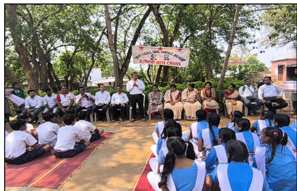
Govt. High School, Denga