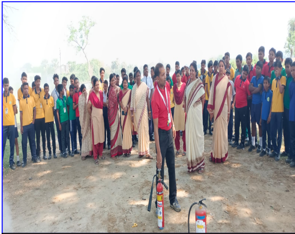
Govt. High School Khaira, Balasore