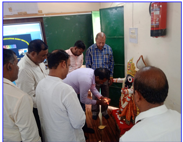
Govt.Nodal High School, Malkangiri