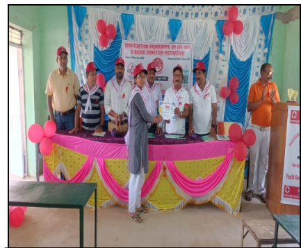
Sarba Mangala Higher Secondary School, Golamunda, Kalahandi