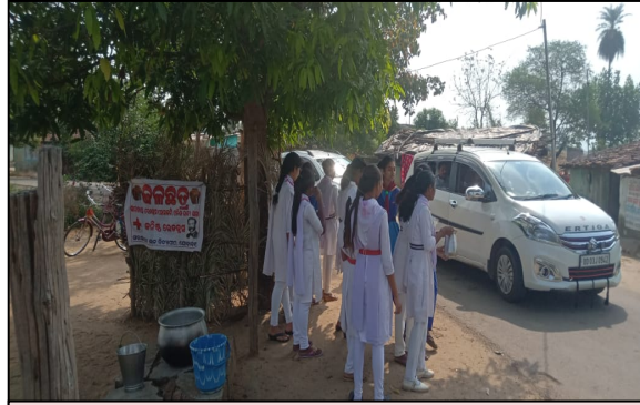
Govt. High School, Kalahandi