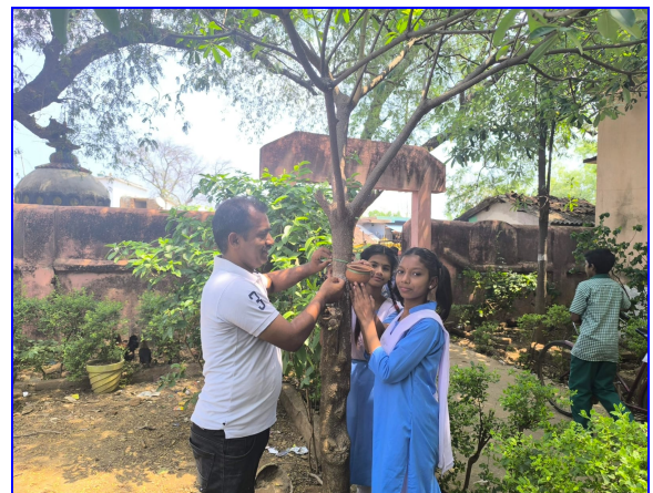
Govt. High School, Denga, Balangir