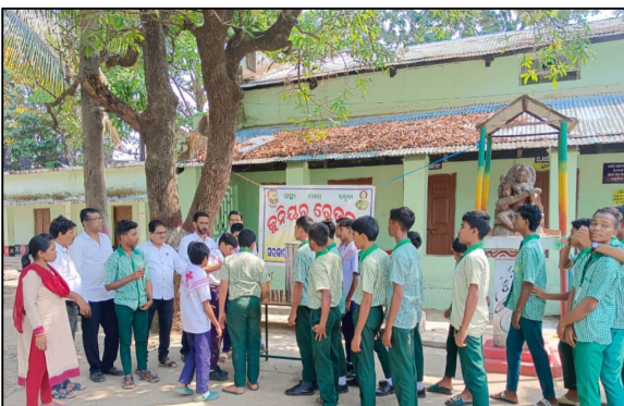
Govt. High School, Koraput