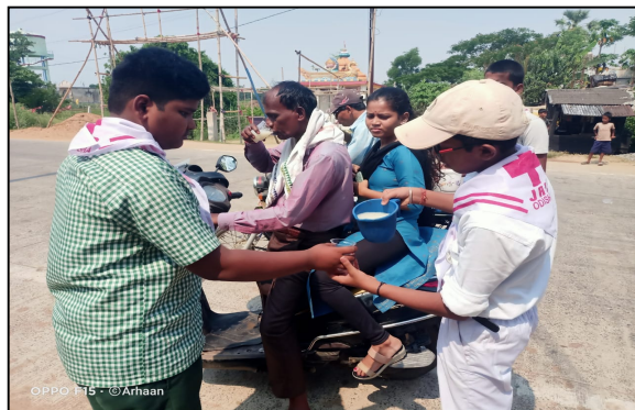
Panchayat Nodal High School, Kendrapara